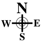
Western Europe Detail Map